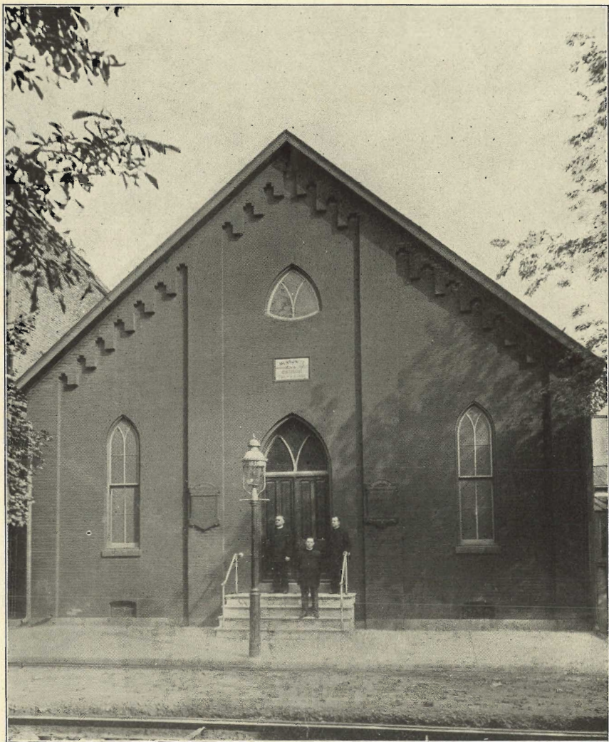
GRACE CHURCH, Tenth and Oley Streets, Reading, Pa.