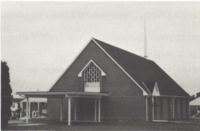
Exterior of Lancaster Church