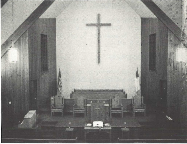
Interior of Lancaster Church