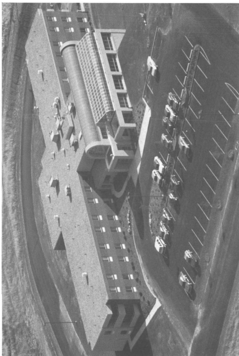
Fellowship Manor, Whitehall, PA Dedication - November 5, 1988