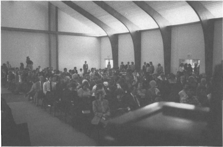
Bible Fellowship Church, Ephrata, PA Dedication - November 12, 1989