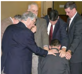
Laying-on of hands.