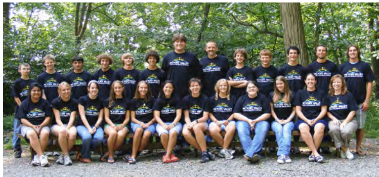
Figure 40 2007 Summer Staff at Victory Valley Camp