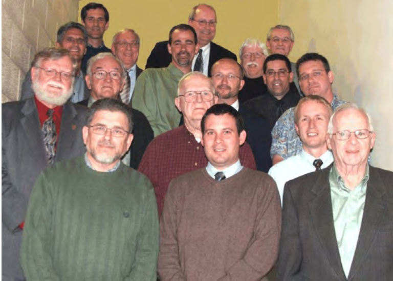
Bucks-Mont Region (LtoR)