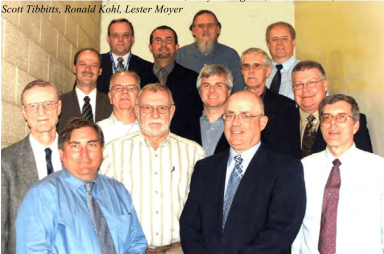
Berks County Region (LtoR)