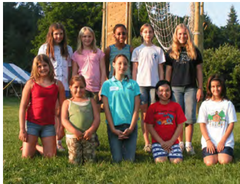
Figure 39 Girls' Cabin at Victory Valley Camp