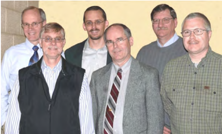
Pocono Region (LtoR)