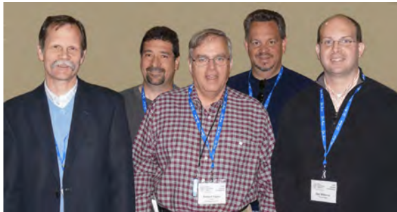
Philly-Area Region (LtoR)