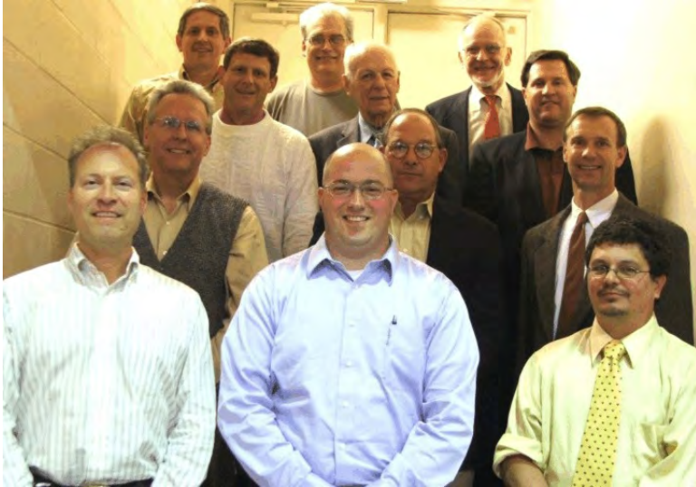
Lehigh Valley Region (LtoR)