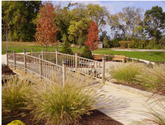
Figure 30 Bridge in new park at Fellowship Community