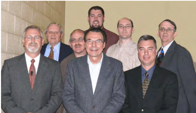
New Jersey - Delaware Region (L to R)