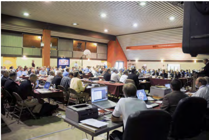
Back in Session