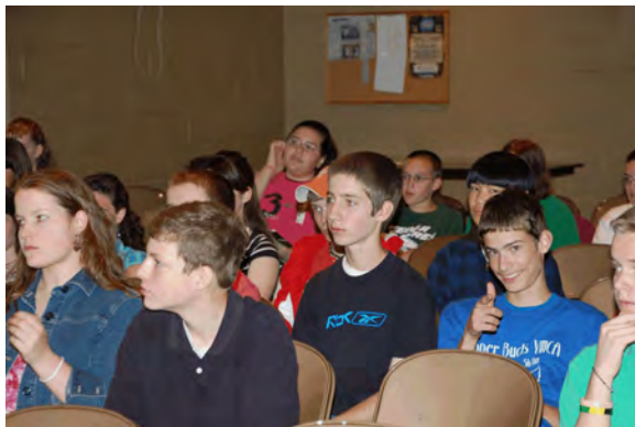
Figure 34 Teens at 2009 Missions Rally, Emmaus, PA