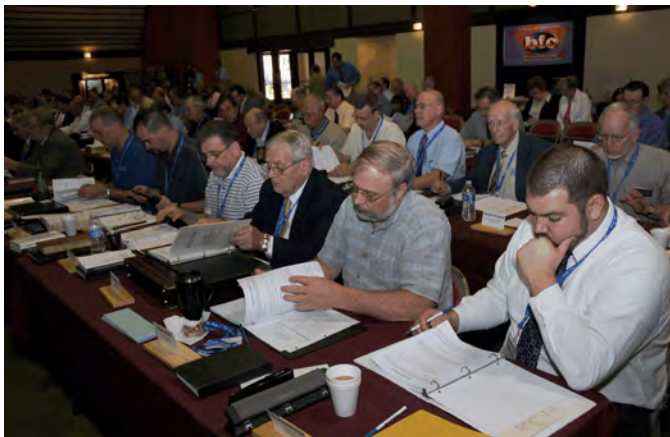
Deep concentration bordering on napping.