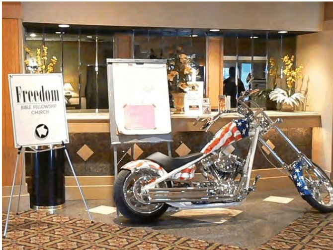
The new "Freedom BFC" at the Holiday Inn, Grantville, PA