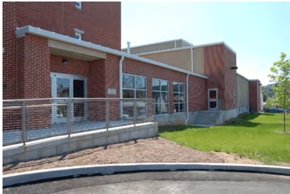
Emmaus, PA, addition - Gym, Kitchen, Classrooms

Walnutport, PA – Calvary BFC Whitehall, PA – Bethany BFC Whitehall, PA – Fellowship Community Woodbury Heights, NJ – New Beginnings York, PA – Faith BFC Zionsville, PA – Zionsville BFC