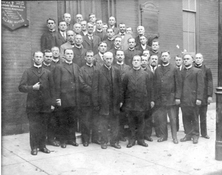
1913 Annual Conference

were usually one day affairs. They held their semi-annual conferences in November and June. Later, they moved them to October and March. In 1880, they began to meet annually with the conference held in March. In 1882, they shifted their meetings to February. From 1882 to 1898, Annual Conference was held in February.