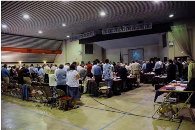
126 th Annual Conference