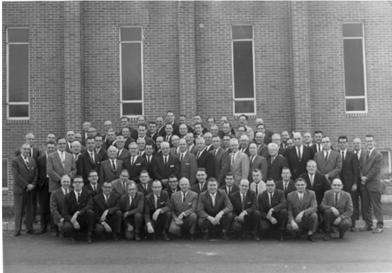
1964 Annual Conference

While the celebration of our first 150 years draws to a close, we can continue to celebrate what God has done and delight in