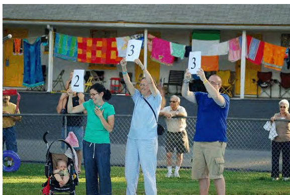
Figure 41 Judging Synchronized Swimming