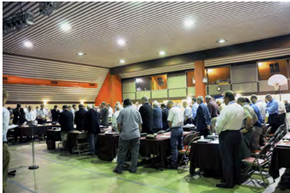
Annual Conference in Prayer