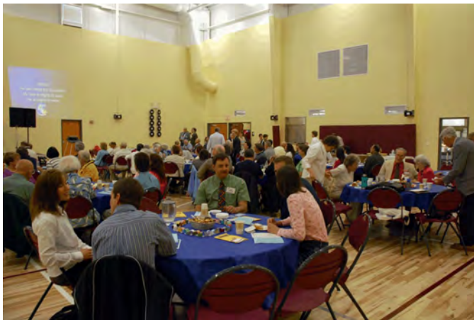
Figure 36 May 14 BFC Missions Rally - Emmaus, PA