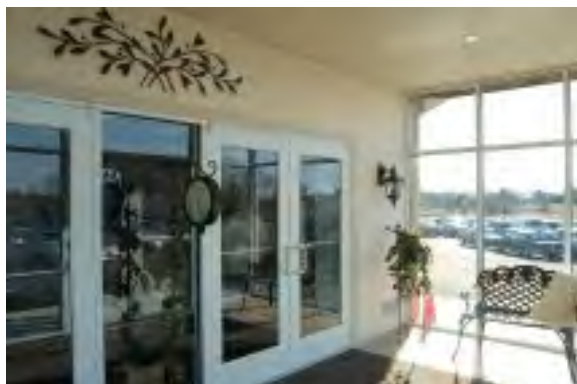
Figure 46 New Entrance at Faith BFC, Harleysville, PA