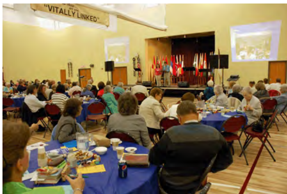
2009 Missions Rally - Emmaus, PA

For more information, contact: BFC Historical Committee 723 South Providence Road Wallingford PA 19086