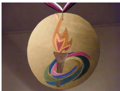
Figure 41 Olympic Theme: "Carry the Torch"