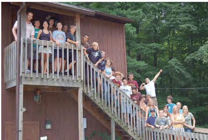
Figure 39 Teens during Week 6, 2008