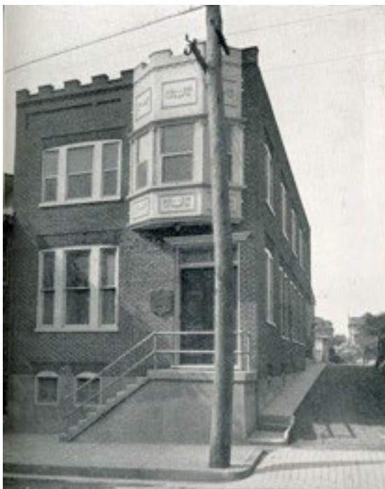
Beulah Chapel - Easton - 1912

Some disagreement must have led to a private meeting in the basement of the church. When they wanted to be free to express themselves and engage in disagreement, they became the committee of the whole or, as in this case, held a private meeting. They agreed to prepare new forms: application blanks, certificates of membership, pastors’ account books, secretary’s account book, death notices (for the pastor’s records, death notices (for the secretary), order books and rules and regulations. They