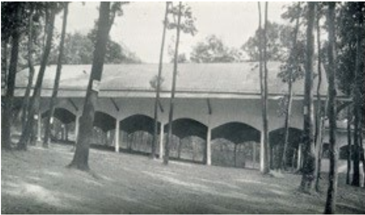
The New Pavilion - Mizpah Grove - 1912

Perhaps the most exciting part of the report of the Executive Board was the completion of a pavilion at Mizpah Grove. Only in its second year, this centerpiece ministry of our denomination was clearly coming together. The pavilion was 72 X 102 feet and had been completed in early spring. “200 loads of filling were used in the grading of the Auditorium which work was nearly all done by the Pastors.” 18 trees had been planted including “Carolina Poplars, a few Catalpa Speciosa, and a few Oriental plains.”