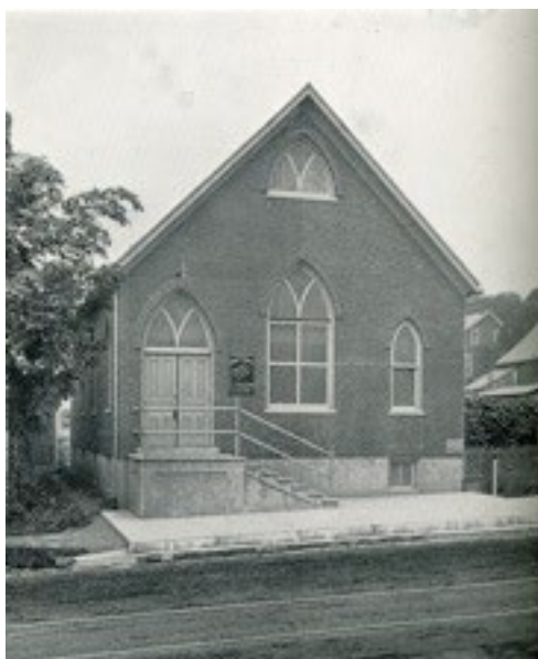
The New “Chapel” in Nazareth -1912

Of course, the work had been going on. The Executive Board reported they had sold the church building in Hereford which was “removed,” presumably torn down. The congregation had long been dormant. The denomination had each year assumed responsibility for the facility but was finally able to unload the property.