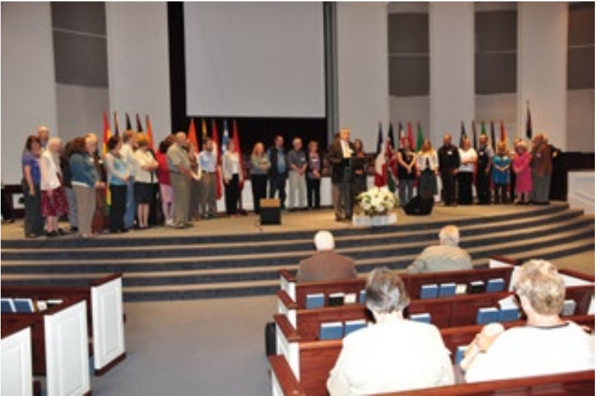
Missionaries at the May Missionary Rally held at Cedar Crest Bible Fellowship Church