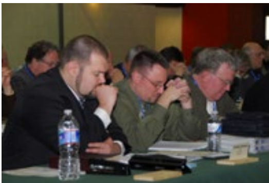
Pastors and delegates engaged in fervent prayer during the BFC Conference