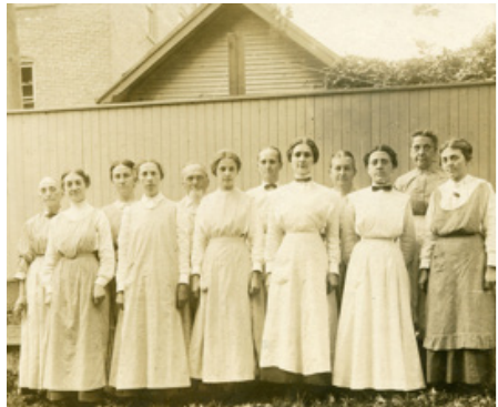
Cooks and Waitresses - Reading 1913

When it was time to eat, the men in the Reading Church in October, 1913, moved to the basement where tables had been set and steaming dishes awaited them. Some were uncomfortable about eating in the church because of the admonition to eat at home which was connected to the Lord’s