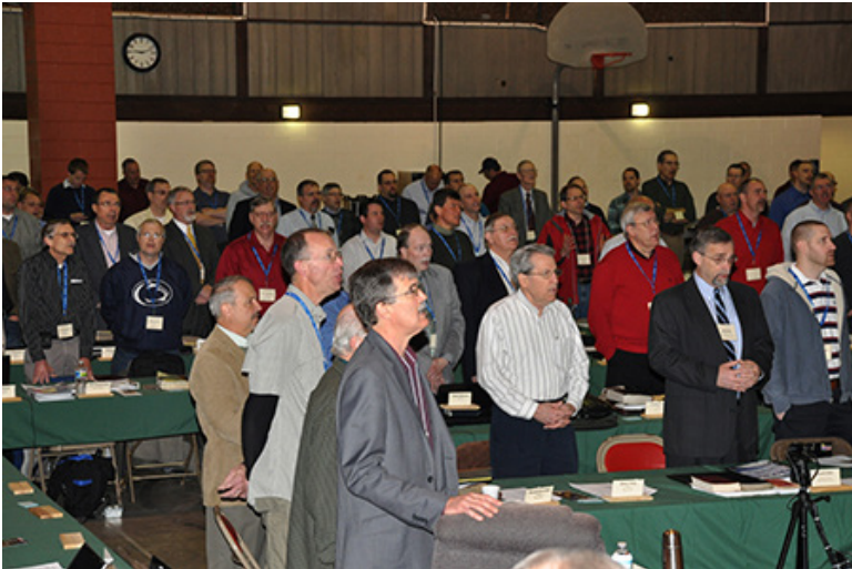
Members of the 130th Conference engaged in heartfelt worship.