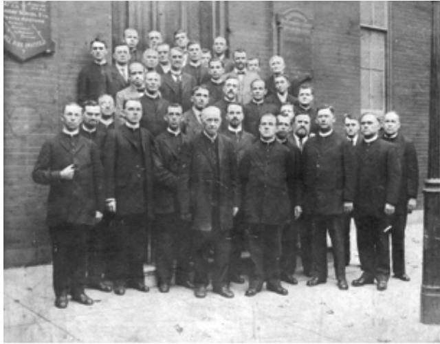
Annual Conference Members - 1913

The first three pews were designated the conference bar where voting members would sit. The basement was the designated area for the occasional private meeting where things were discussed that others should not hear. No one was allowed to leave the bar unless permission was granted by the chairman. Only F. M.