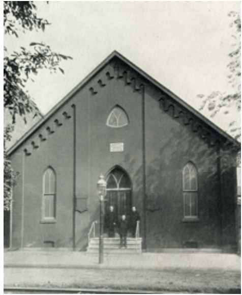
Reading Church – 1913

In 1913, when it was still called The Annual Conference, the meetings were held in the Reading Church. In those days, various churches took turns hosting the conference and providing hospitality. It was special for a church. The heater was filled with coal to assure that all was warm and cozy if the air was chilly and the building was damp. Church members made sure the building sparkled. Nothing would be half way or half done for their guests.