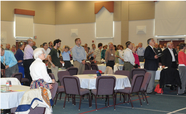
2013 Missionary Rally - Faith Bible Fellowship Church, Lancaster, PA