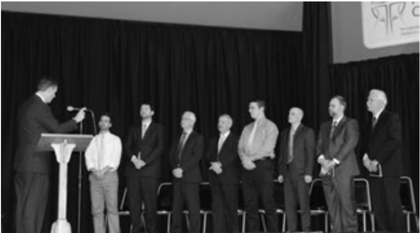
Charge to the Ordinands