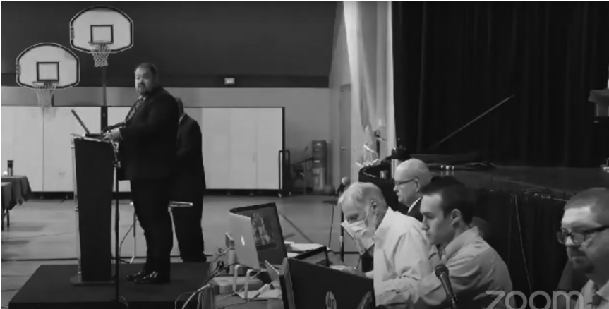
The BFC Conference secretarial staff, hard at work serving all who attended, either “live” or on their computers.